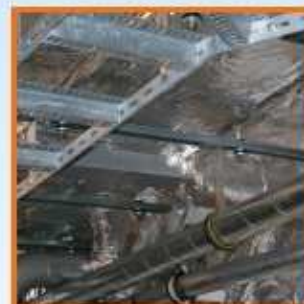
Substructure made of MPC channel system