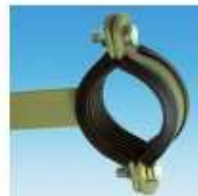
Welded pipe holder