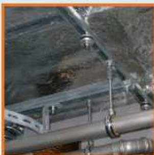
Vibration controlled pipe mount on substructure