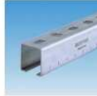
MPC support channel