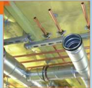
Air duct and piping mount with MPC channel system

Our primary goal is to manufacture practical, workmanlike products of the highest quality. A number of highly qualified staff are available to provide advice on application techniques and assist in preparation – the best guarantee that our customers profit from our know-how and receive a high quality service.