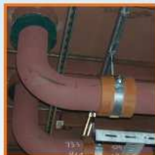
Pipe mount with wooden blocks and MPC channel system