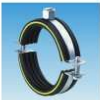
Pipe clamp with Dämmgulaat® yellow