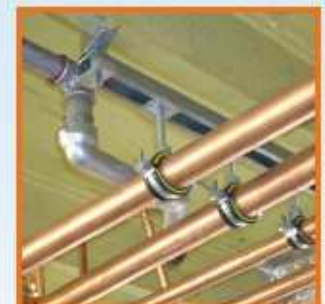
Pipe mount with MPC channel systems