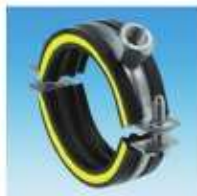
Pipe clamp 45° connection