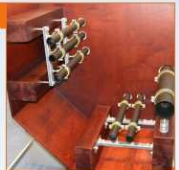
Pipe mounting in wooden ships with MPC channel system